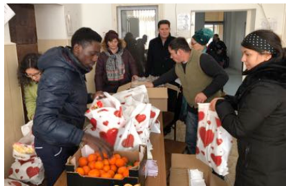
(pictured above preparing the food gifts)

It is our hearts desire to continue to visit, bring food and the joy of the Lord to the forgotten elderly at the Stefanesti Elderly Home in Romania as we strive to provide for their needs. The Lord blessed us to visit them with a group of disciples from Iasi. It is such a great blessing to see them being involved in ministry and it is our hearts desire to be able to disciple them so